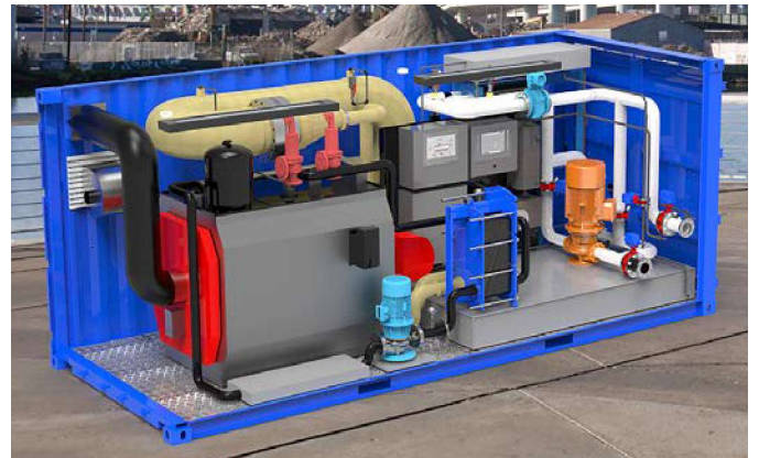
3D Illustration and photo of Bawat's mobile BWMS

All components of the BWMS are installed in a standard container.