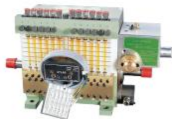
L, S 50MC