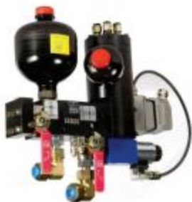
50 - 60MC(MC-C)

Electronical Lubricators for MAN low speed diesel engines