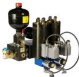
70 - 98 MC(MC-C)