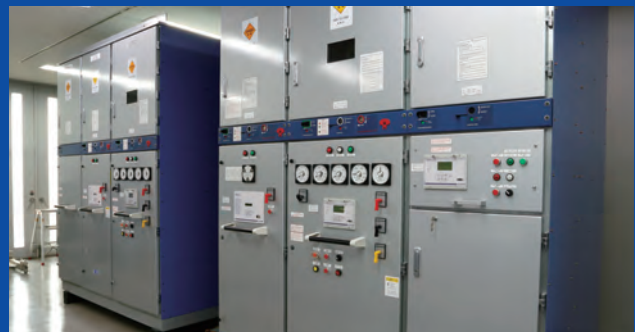
High-voltage switchboard simulator