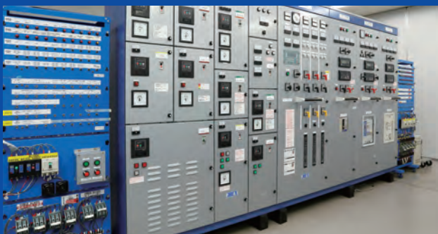
Low-voltage switchboard and Starter Panel simulators