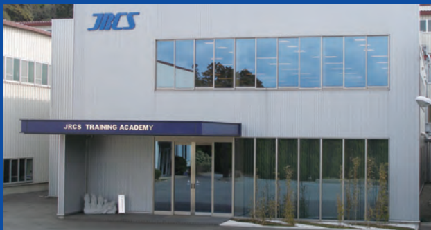
Training center adjacent to factory