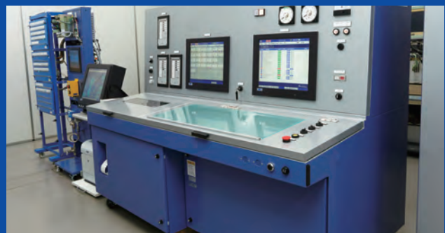
Engine Control Console and Alarm & Monitoring System simulators