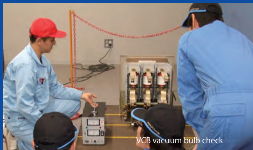
VCB vacuum bulb check

We help ensure safe navigation by improving your crew's knowledge and skill!