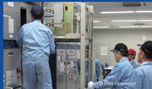
VCB lifter operation