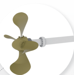
Main Engine Shaft

Torque, Power, RPM Thrust(optional) Accumulated info