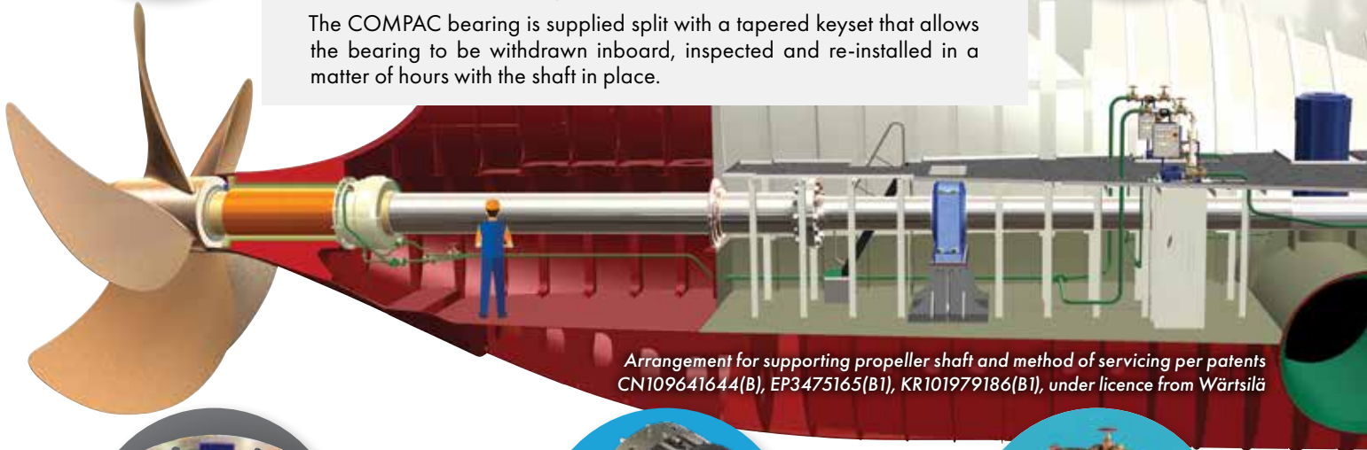
Arrangement for supporting propeller shaft and method of servicing per patents CN109641644(B), EP3475165(B1), KR101979186(B1), under licence from Wärtsilä